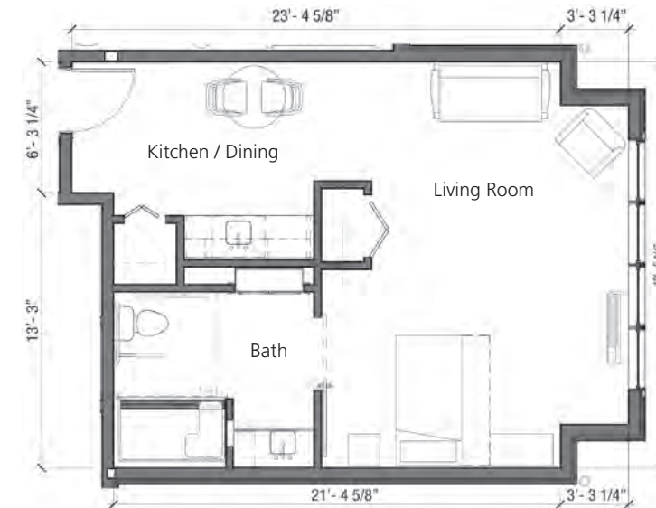
UNIT C Approx. 478 sq. ft.