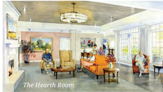
The Hearth Room

At Altenheim Senior Living, we believe memory loss and dementia-related illnesses should never determine a person's choice or desire to live as they always have — in a cozy, comfortable, residential environment where they can enjoy life to its fullest potential.