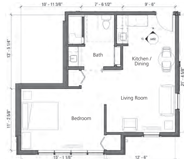
UNIT D Approx. 542 sq. ft.

Additional information: $2000.00 deposit due on application.